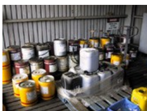
Dangerous Goods Assessments